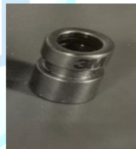
Figure 1: Mirror, a highly polished metal ring (3M Company, USA, St, Paul).

The null hypothesis is that, resin composite light curing unit with the accessories give the same test of Vickers hardness as without when curing large diameter composite.