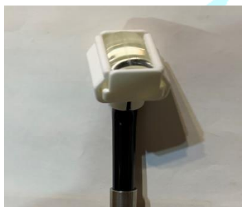
Figure 3: 3M lens attached to the lens.

A universal color of microfilmed composite (Helio Progress) was used. Thirty specimens 10 mm in diameter and 2 mm thick and thirty specimens of 6 mm in diameter and 2 mm thick were prepared in a split mold. The split mold was placed between two Mylar strips and covered with a glass slide to assure a smooth surface which could be a measured accurately. The mold cavity was overfilled with composite and pressed against the Mylar strip and glass slide to remove the excess. Ten specimens of 6 mm diameter (Group I) and ten of 10 mm diameter (Group IV) were exposed for 40 seconds to light from a light cure unit (Vislux, 3M Company, USA, St. Paul). Ten specimens of composite with 6 mm diameter (Group II) and ten specimens of 10 mm diameter (Group V) were exposed to light from the same light cure unit for 40 seconds, after the mirror, a highly polished metal ring was attached. Ten additional specimens of composite with 6 mm diameter (Group III) and ten specimens of 10 mm diameter (Group VI) were exposed to light from the same light cure unit, after was attached. kulzer and CO. GMBH, wehrheim-Germany) (Figure 3) a box of four frames to be used alternatively during sterilization while the lens attached to one frame.